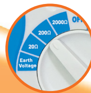
Earth Resistance 200kΩ