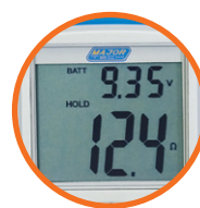
Dual LCD display with backlight